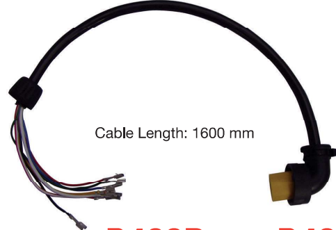
Cable Length: 1600 mm